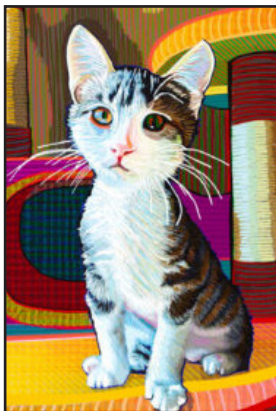
"Opal" by Rod Whyte

Due to new guidelines for a fear-free space, we cannot accept artwork that has realistic depictions of dogs, cats, and/or birds. Stylized or abstract pieces with these subjects are allowed.