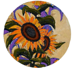
"Sunflower Splashes" by Tiara Safic-Martin

VCA Old Town Animal Hospital is located at 425 N Henry Street, Alexandria, VA 22314. There is a parking lot behind VCA Old Town accessible from Princess Street. The animal hospital is open Monday-Friday 7:30am-7pm, Saturday 8am-3pm. Visitors must let the front desk know they are there to view the art exhibit.