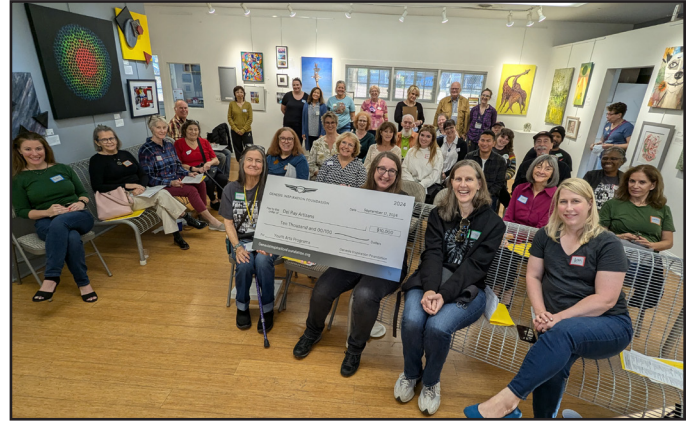
Members express gratitude for the donation from Genesis Inspiration Foundation (2024 Annual Meeting)