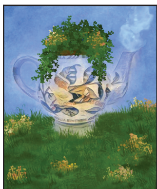
"Floral Infusion" by Suzan Ok Shumate and Sue Shumate

Digital entry deadline: Wednesday, April 17 by midnight