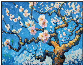
"Cherry Blossom" by Sunny Chen

Digital entry deadline: Wednesday, April 3 by midnight