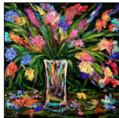
"Flowers Partying (who put vodka in the water?)" by M. Reday Cook