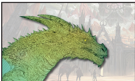
"Snarler" by Erica Hughes

Open to Area Artists Digital Entry Deadline: Sunday, September 10 by midnight