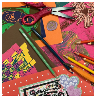
"Ready to Go" by Ellen Rosenthal

Got Prints? Maybe you've got some extra prints from your printmaking experiences lying around? Wondering what to do with them? During the Post-Printing Party Workshop, we will explore ways to give new life to those extra prints: mixed media, collage, paper weaving, foldables, and more! Each participant needs to bring at least one print (preferably more), a pair of scissors and, if possible, pieces or scraps of decorative paper. In addition, an optional Print Exchange will take place: leave a print in the basket as you arrive and take a new one home at the end.