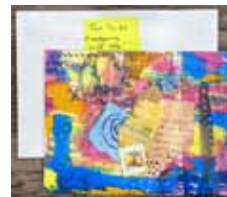
Card by Linda Elliff

You may sign up multiple times, but please complete your current swap before signing up again. The 41st group is forming now and has a spot for you! Sign up at DelRayArtisans.org/card-swap