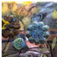
Detail of "The Forbidden Garden" by Betsy Mead

Explore the hidden, under the surface, microscopic, imagined, or dreamt that make life so much richer. The juror is renowned scientist and artist Michal Gavish.