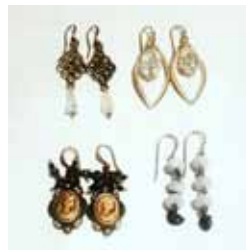
Earrings by Y'vonne Page-Magnus

Design and make four pairs of earrings using beautiful findings, semi-precious stones and crystals inspired by the Victorian Era. Add your own style to each pair of earrings with guided instruction along the way. The workshop fee is $35 Del Ray Artisans member / $45 non-member, plus a $25 supply fee. Instructor: Y'vonne Page-Magnus. Register by midnight on January 15.