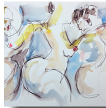
Detail of "To The Beat" by Katherine Rand

Drop-in and practice life drawing. Bring your supplies and join us at the gallery to draw or paint our nude model. Traditional drawing media (such as pencils, pens, and charcoal) are welcome; and pastels, watercolor and ink are permissible. Please do not bring acrylics or oil paints. We don't supply easels - only plenty of chairs - but you are welcome to bring your own easel if you want to use one. All skill levels are welcome. More info at DelRayArtisans.org/life-drawing .