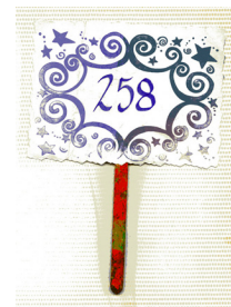
1999 Offbeat Auction Bid Paddle