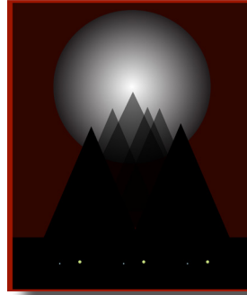
"Shadows" by Kelly Postula

Seeking artwork focusing on shadows, negative space, and often overlooked components of a scene. Your art may reveal physical separations highlighting hidden always-there isolation, or shadows and negative space highlighting varied perceptions of "the same thing." Looking forward to your interpretations of this theme.