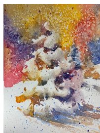
Snowy Tree by Marni Maree

Learn to use many watercolor techniques such as wet in wet, salt texture, lifting, splattering and more, as you paint a very colorful snowy tree scene. You will love to see how colorful white snow can be! Demonstration and hands-on activity, suitable for high school age and adults. Register by January 24.