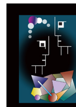
"DADA 2.0" by Kelly Postula

This exhibit invites artists to express absurdity and discontent through the lens of Dada. All forms of art are welcome – particularly the mediums of collage, cut-up writing, and sculpture, which embody the spirit of original Dada. Reject logic, reason, and decadence through an artistic expression of nonsense, irrationality, and unconventionalism. The more absurd, the better! Details at DelRayArtisans.org/2021/12/dada-cfe .