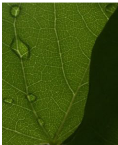
"Under the Green" by Jonathan Ottke

Nature has served as a creative muse for centuries for many artists. The beauty of the ocean, a mountain landscape, an ocean seashore, or wildlife has moved many artists and art lovers to a sense of calm and wonder for the environment. This exhibition will celebrate the beauty of art in nature, whether animals, plein air or other natural scenes.