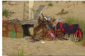
"Beach Shelter" by Pamela Day

During the pandemic we all have learned what it means to shelter in place. Shelters are often structures, yet sometimes just a state of where one is. For many it is a way to connect to our dwellings, and for others it merely means finding refuge. Some people even choose to shelter from the facts of the COVID-19 virus and its spread. The current crisis has nearly 40 million American renters at risk of homelessness. A building, box, bench, grate, tent, car—all places where humans shelter. Come see how local artists explore the concept of shelter in the Give Me Shelter art exhibit at Del Ray Artisans.