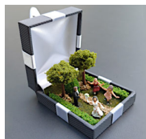
The Bouquet Toss by Betsy Jones

Digital entry deadline: Thursday, September 10 by midnight