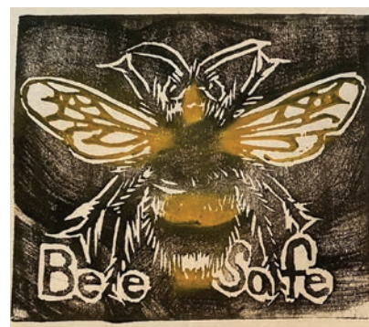
"Bee Safe" by Kathy A. Turner

Receive small, handcrafted artwork in your mailbox! View the Art by Mail exhibit and select some one-of-a-kind art today! The exhibit features small format artwork from Del Ray Artisans members—original paintings in watercolor, oil, and acrylic; mixed media art and artful cards; plus, small 3D works. Artwork will be mailed directly from the artist within 10 days of purchase. View now at: DelRayArtisans.org/artbymail