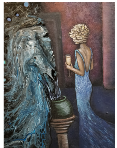
Something's Brewing by Lesley Hall.

To purchase artwork, email Gallery@DelRayArtisans.org with the artwork title, artist's name or description by June 10, 2020. The art will be available for pick up once the gallery reopens.