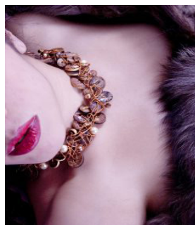
Jewelry by Wirealm