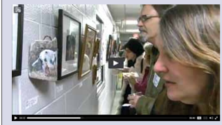
Featured on WETA Arts!

Episode 304 features GWW show Paws 'N Claws for Art starting at the 5:35-minute mark. View the video at: watch.weta.org/video/2365464001/