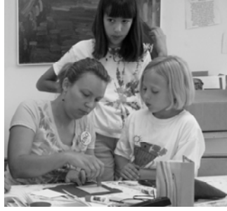
Making a book

Truly in the spirit of arts building communities, public art created by campers can be viewed by all. Garden stepping stones painted with nature and environmental themes and sealed with low VOC cement gloss have been re-installed in the Mt. Vernon Community School's garden. Located directly along the side of the school, next to the playground on E. Uhler Avenue, the stones can be enjoyed by the whole neighborhood. Stop by and take a look.