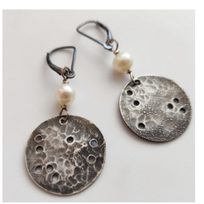
Amy Kitchin Hower: Tardigrades (Water Bears) Sold out

Liz Martinez: 3 inch Mandala in white and red Sold out