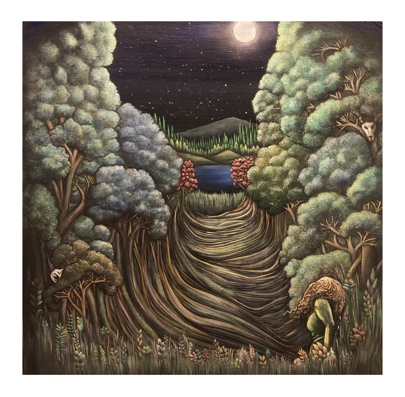
"Look Up" by Lesley Hall