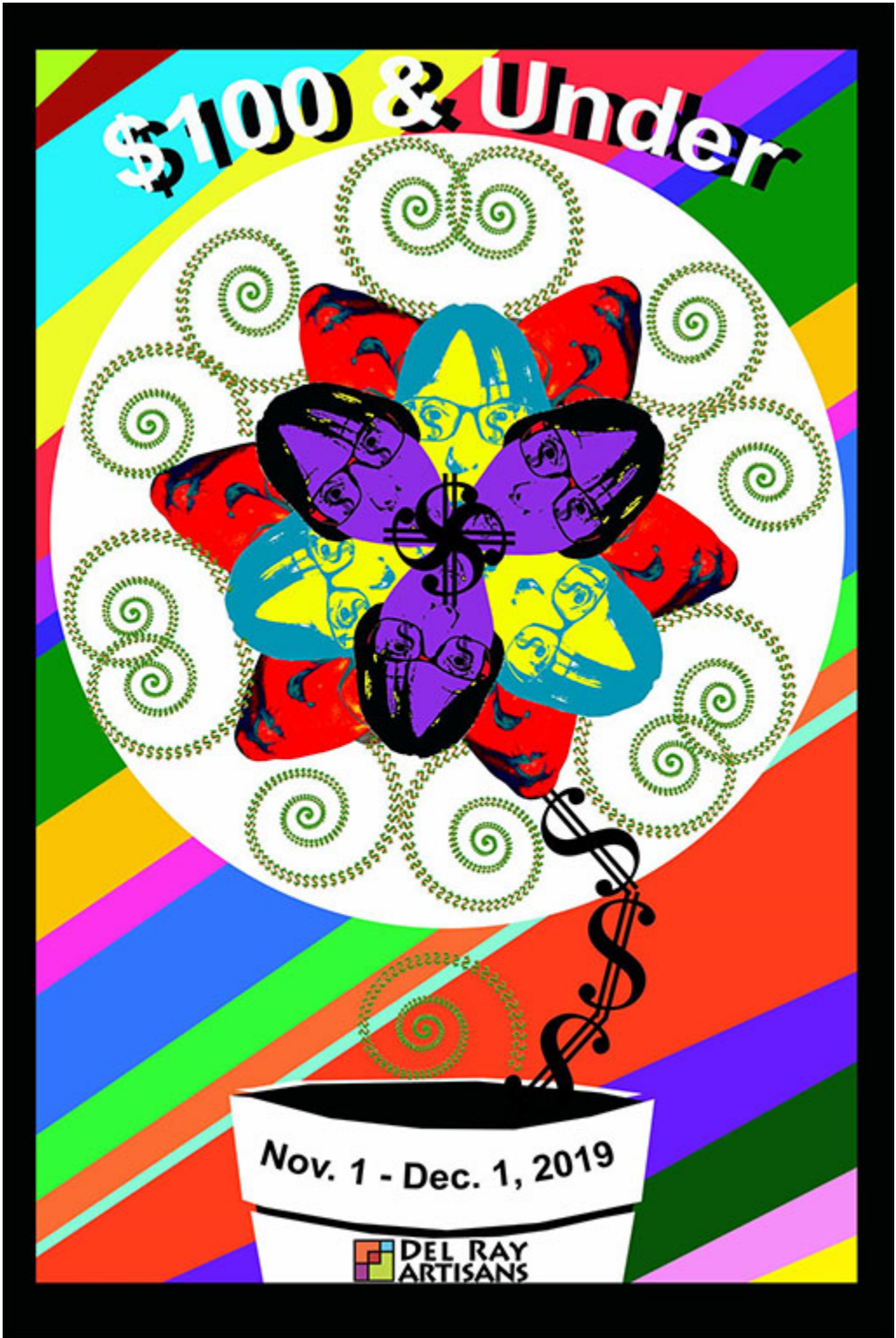
"It's Blooming Art" by Kathy Turner