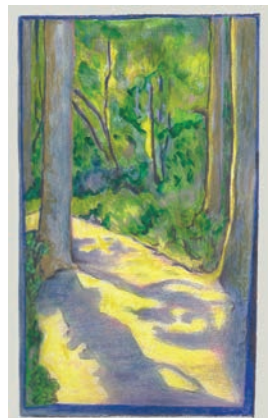
"Cedar Trail" by Margaret Wohler

Outdoors In is an exhibition about how artists see nature and depict it in painting, sculpture, textiles, found materials, and drawing. This show is for Del Ray Artisans members and all local area high school and college students. Students are not required to pay an entry fee. Outdoors In will have cash prizes for the top selected entries: $100 for best in show, $50 for second place, and $25 for honorable mention.