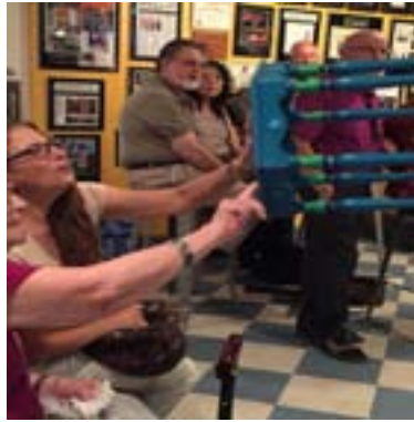
Peacock Blue table by Becky Barnes