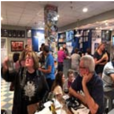
Mingling before the auction