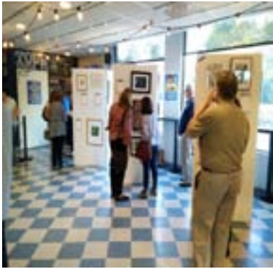
Silent auction bidding