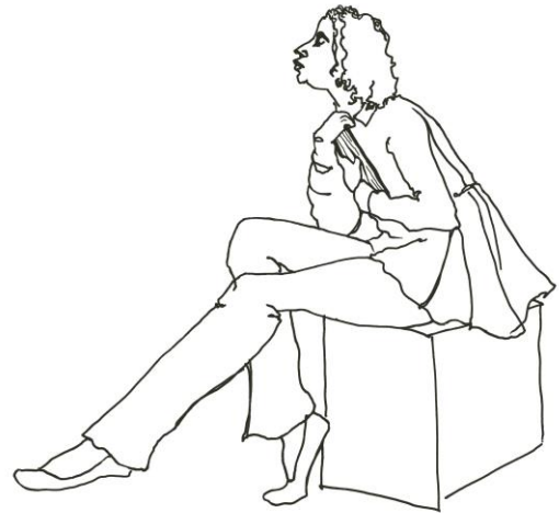
Drawing by Katherine Rand

If you want to spend an extended amount of time on a pose, come to our long pose sessions. These sessions are generally composed of two long poses with perhaps a few warm-ups at the start.