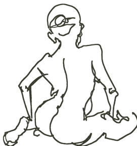
Drawings by Katherine Rand

These sessions are generally composed of two long poses with perhaps a few warm-ups at the start.