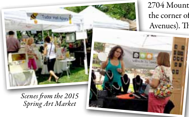
Scenes from the 2015 Spring Art Market