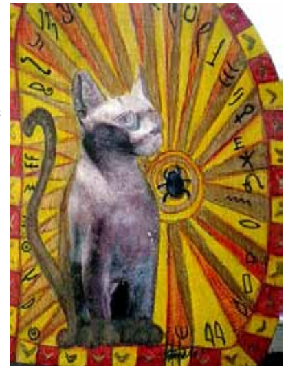
by David Camero

Coming up next on our exhibit schedule is ALTARS: Religious Rituals . What comes to mind when you think of altars? They could reflect places of heavenly worship or nether worldly sacrifice. They can be simple raised platforms or elaborate structures used for religious ceremonies. Del Ray Artisans (DRA) and Art Latin American Collective Project (ALACP) have teamed up to present this unique artistic challenge to their members. Artists, dig deep into your imaginations! Explore the use of altars in religious rituals worldwide and create your interpretations in any and every form of media. For more information, see: TheDelRayArtisans.org/CFE