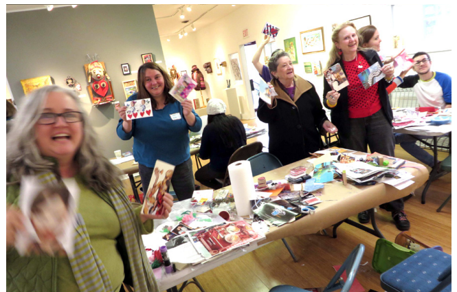
Card-making Cupids are all smiles!