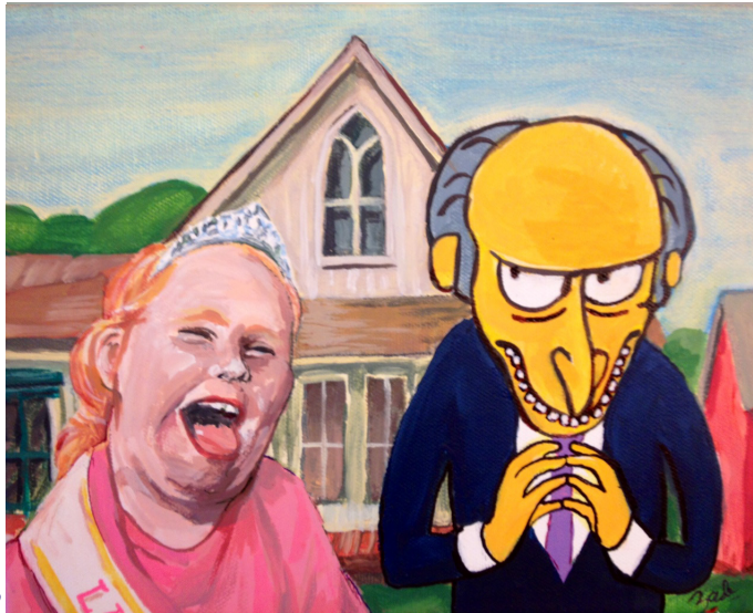
"An Excellent Boo-boo, American Gothic" by Zade Ramsey

Artists take this opportunity to pay homage to their favorite masters, question the hoopla surrounding particular pieces and praise, critique, or dish the artist and peers who have influenced them. Satire can be a big compliment to a master artist, as are works that pay homage to the master from any era or even today. See a picture of each artist's selected master/master artwork displayed next to the 2- and 3-dimensional artwork and textiles.