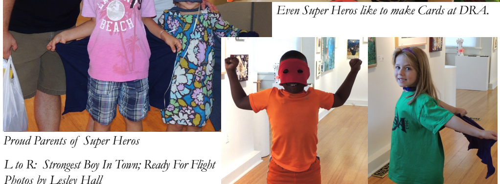
Proud Parents of Super Heros

L. to R: Strongest Boy In Town; Ready For Flight