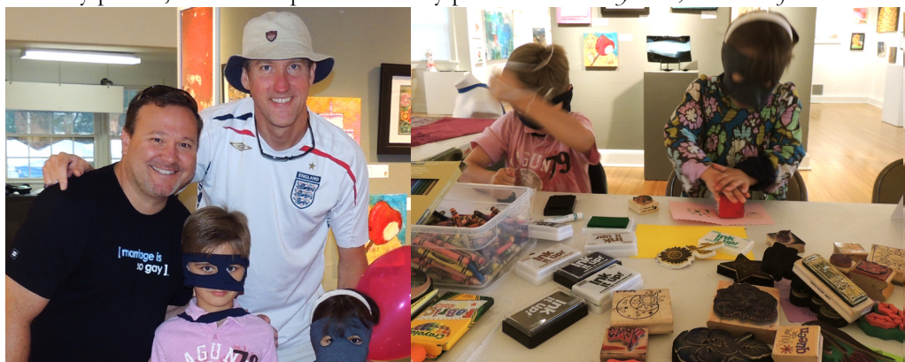
Even Super Heros like to make Cards at DRA.