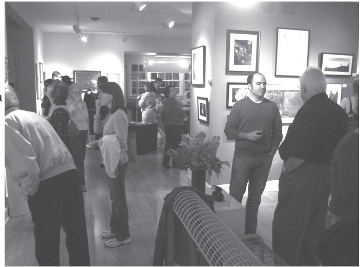
Opening reception attendees enjoy the “Once Upon A Time” art, hors d’oeuvres, and the company.